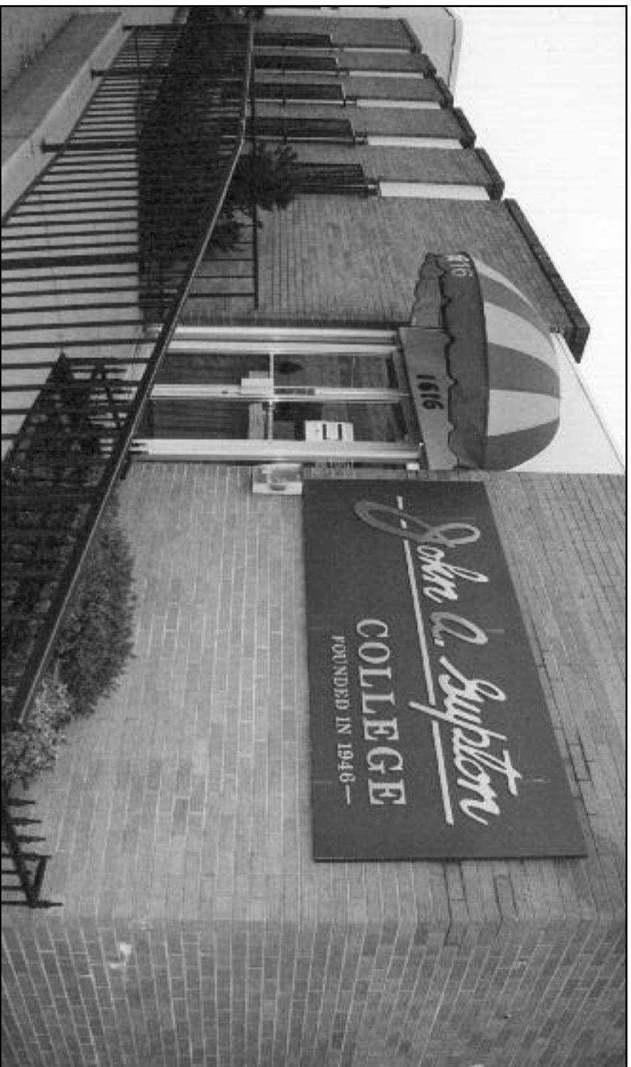
JOHN A. GUPTON COLLEGE