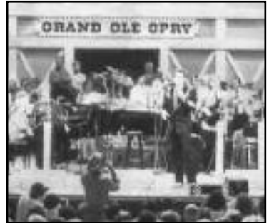
GRAND OLE OPRY