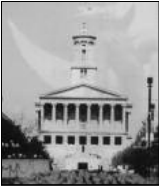
STATE CAPITOL BUILDING

John A. Gupton College is nestled in the middle of Downtown Nashville, just minutes from many of the cultural attractions that make Nashville a great city. Nashville, with its beautiful skyline, state capitol, convention center, museums, and Riverfront park, offers many features enjoyed by all ages. Music Row, the Grand Ole Opry and the world renowned General Jackson Showboat are just a few of the reasons Nashville is known as Music City U.S.A. Nashville is the home of numerous sporting events such as the National Football League “Tennessee Titans” and the National Hockey League “Nashville Predators” just to name a few.