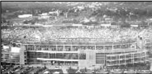
NASHVILLE COLISEUM HOME OF THE TENNESSEE TITANS

John A. Gupton College is nestled in the middle of Downtown Nashville, just minutes from many of the cultural attractions that make Nashville a great city. Nashville, with its beautiful skyline, state capitol, convention center, museums, and Riverfront park, offers many features enjoyed by all ages. Music Row, the Grand Ole Opry and the world renowned General Jackson Showboat are just a few of the reasons Nashville is known as Music City U.S.A. Nashville is the home of numerous sporting events such as the National Football League “Tennessee Titans” and the National Hockey League “Nashville Predators” just to name a few.